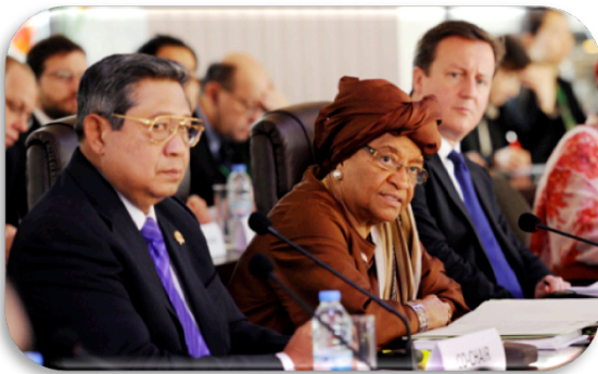
UN High Level Panel meeting in February 2013 in Monrovia, Liberia 5

established the UN System Task Team on the post-2015 Development Agenda, which published its first report “Realising the Future We Want for All” 1 in June 2012. The report proposes a future development vision based on four key dimensions, namely inclusive social development, inclusive economic development, environmental sustainability and peace and security. From May 2012 to early 2013 the UN organised 50+ country consultations 2 in developing countries to receive input to the future framework as well as thematic consultations 3 on more than ten topics such as water and food security and nutrition. In July 2012, the Secretary General launched his High-level Panel of Eminent Persons 4 , chaired by the Presidents of Indonesia and Liberia and the Prime Minister of the United Kingdom, and also including representatives from the private sector, civil society, academia and local authorities.