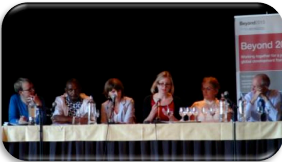
Beyond 2015 European seminar in May 2012, CSO representatives discussing the 'world we want'

On the civil society side the Beyond 2015 campaign 12 has brought together over 620 CSOs in 97 countries from all over the world with the aim of creating a strong and legitimate successor framework for the MDGs. CSOs have organised numerous workshops and already started the dialogue on various thematic issues and principles with policy makers. EU-12 development CSO platforms met to discuss their views on the post-2015 framework 13 in April 2012.